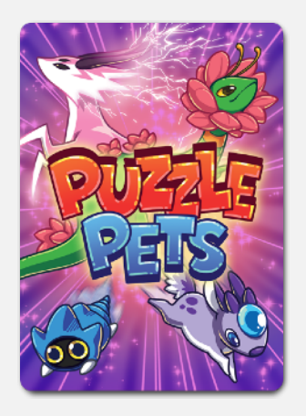
Capture a pet and level it up!