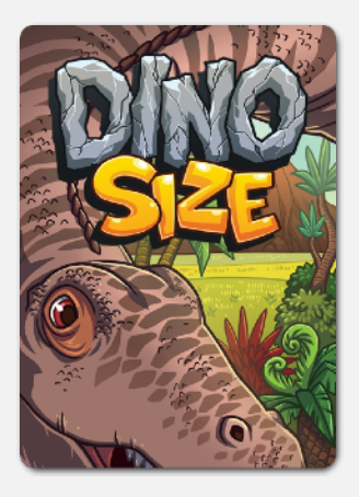
Huge effects for huge costs!