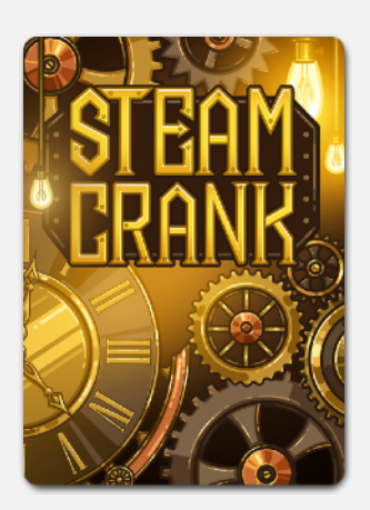
Chain cards of the same color for bonus effects!