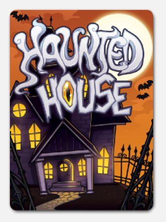
Spooky discard effects that help you!